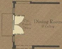
Optional French Doors

See all information about San Joaquin Hills @ www.SJHexpert.com Joe Duenas 949-632-3819